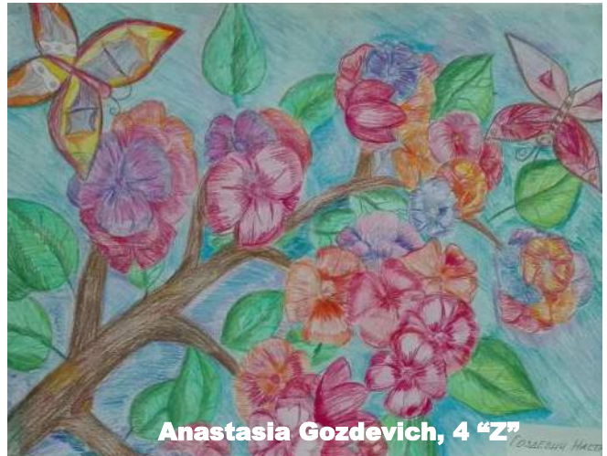
Anastasia Gozdevich, 4 "Z"