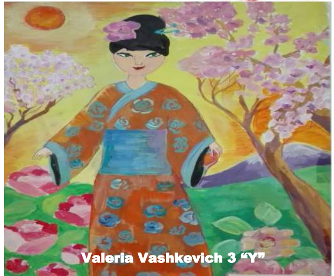
Valeria Vashkevich 3 "Y"