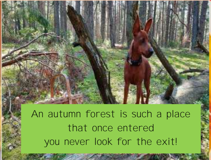
An autumn forest is such a place that once entered you never look for the exit!