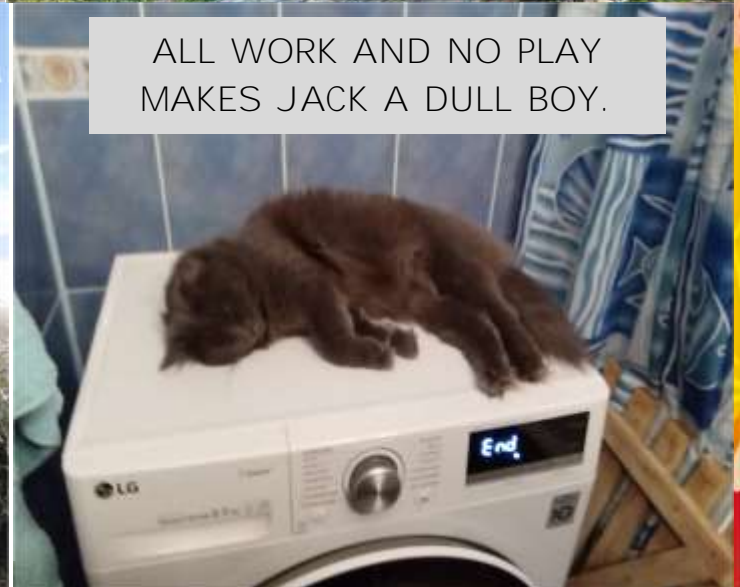
ALL WORK AND NO PLAY MAKES JACK A DULL BOY.