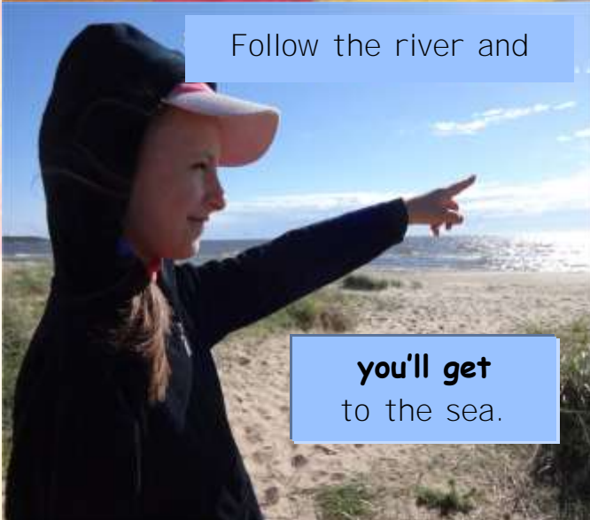
Follow the river and